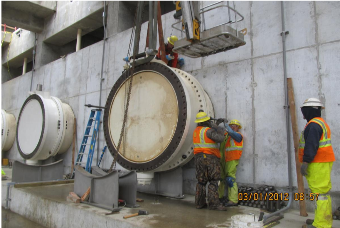
Balfour Beatty laborers bolt on 84" diameter butterfly valve on discharge pipe.