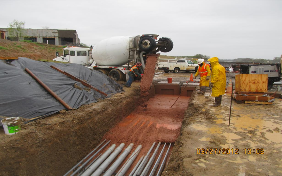
Balfour Beatty subcontractor Central Sierra electricians placing concrete dyed red in the duct bank.