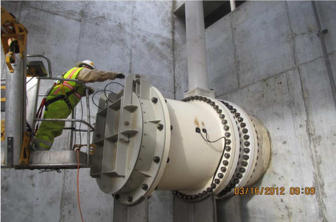
Balfour Beatty subcontractor Corpro welding for cathodic protection system to discharge pipe.