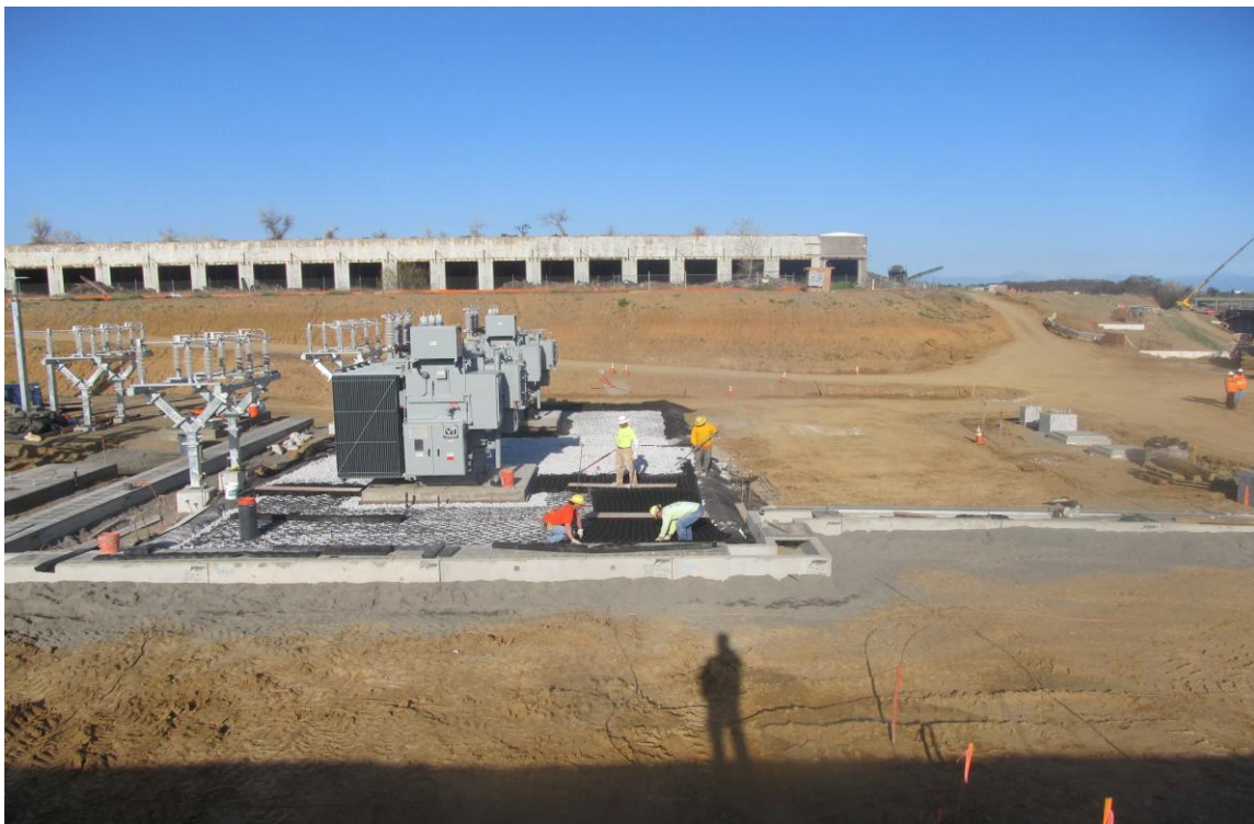
Installing geocell grid for oil spill containment basin of transformer at the switch yard.