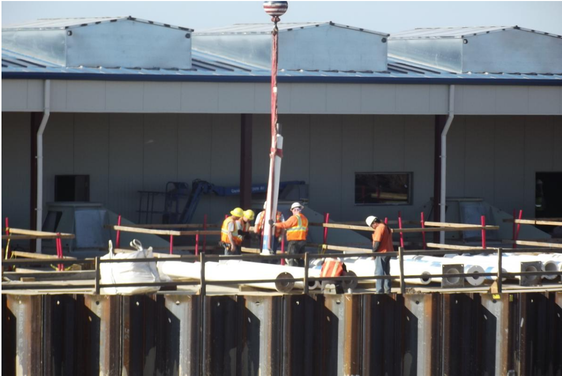
Rigging the valve shaft for the 60" butterfly valve for pump #1.