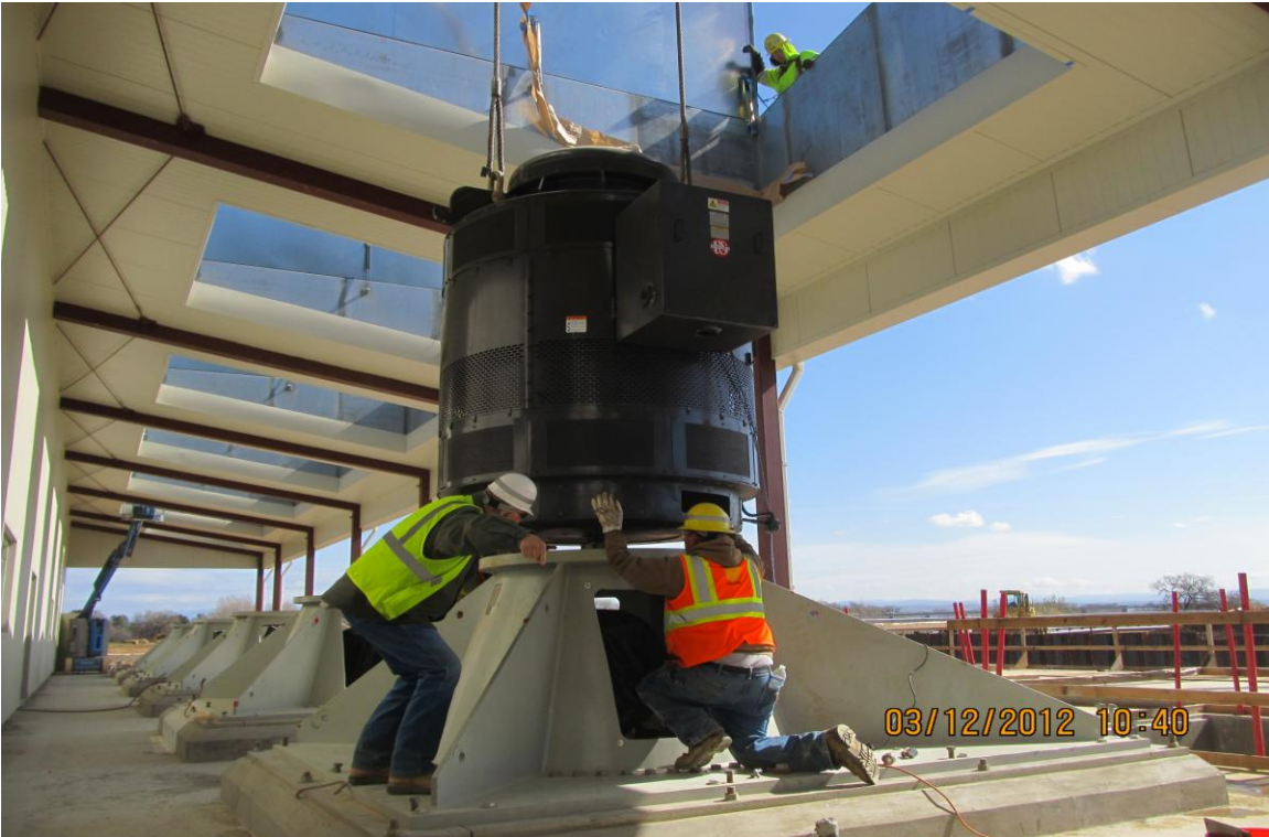
Balfour Beatty laborers setting a pump motor on a pedestal with the assistance of a 120 ton crane.