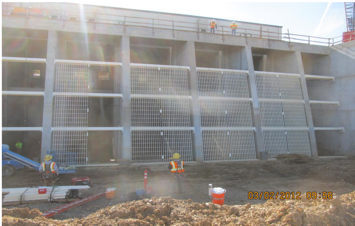
Looking downstream at an overall view of the sump bay trash rack installation.