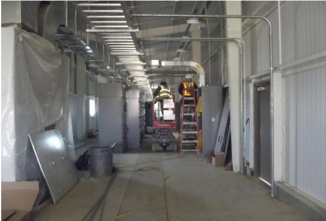
Balfour Beatty subcontractor Central Sierra Electric installing the cable tray at the pumping plant.