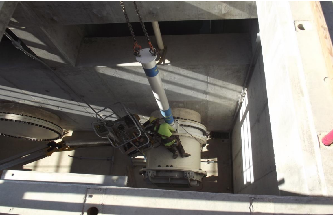
Installing the torque tube at the 84" butterfly valve for pump #3.